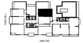
APARTMENT TYPE 'G' LOCATION